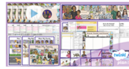
Family and Friends