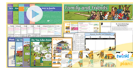
Family and Friends