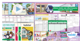
Let's Visit a French Town