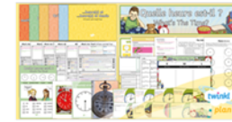
What's the Time?