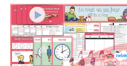
All in a Day

listen attentively to spoken language and show understanding by joining in and responding