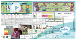
Getting to Know You