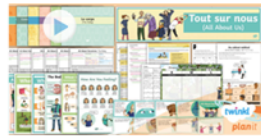
All About Ourselves