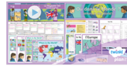
Where in the World