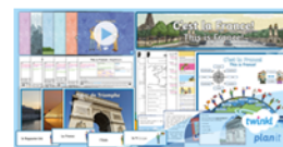
This is France