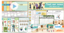
All About Ourselves