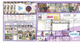
Family and Friends