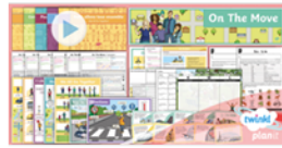
On the Move