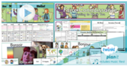
Getting to Know You