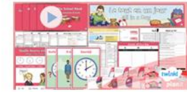
All in a Day

describe people, places, things and actions orally and in writing