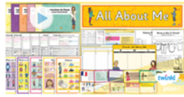
All About Me