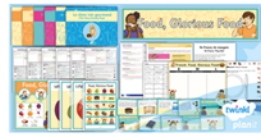
Food Glorious Food