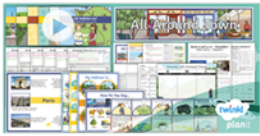
All Around Town