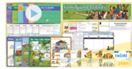
Family and Friends