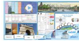
This is France