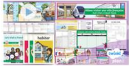
Let's Visit a French Town