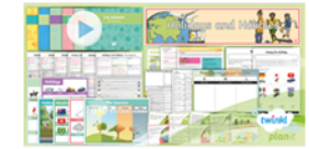
Holidays and Hobbies

listen attentively to spoken language and show understanding by joining in and responding