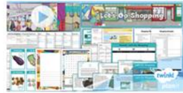
Let's Go Shopping